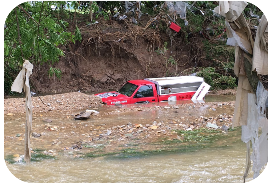
Identifying potential property to purchase