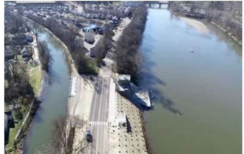
White River-to-Canal Intake (70 MGD)