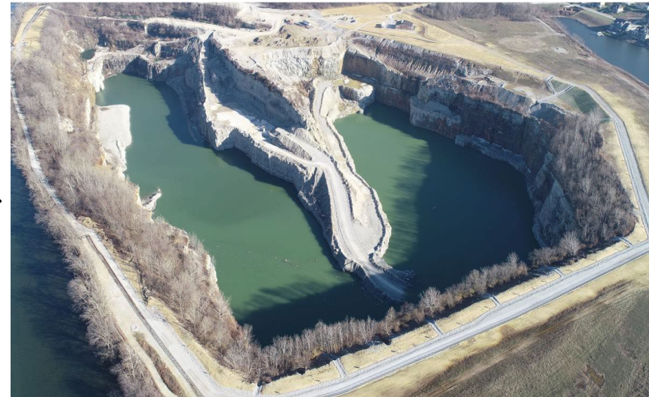
Citizens Reservoir (3.2 B-Gals)