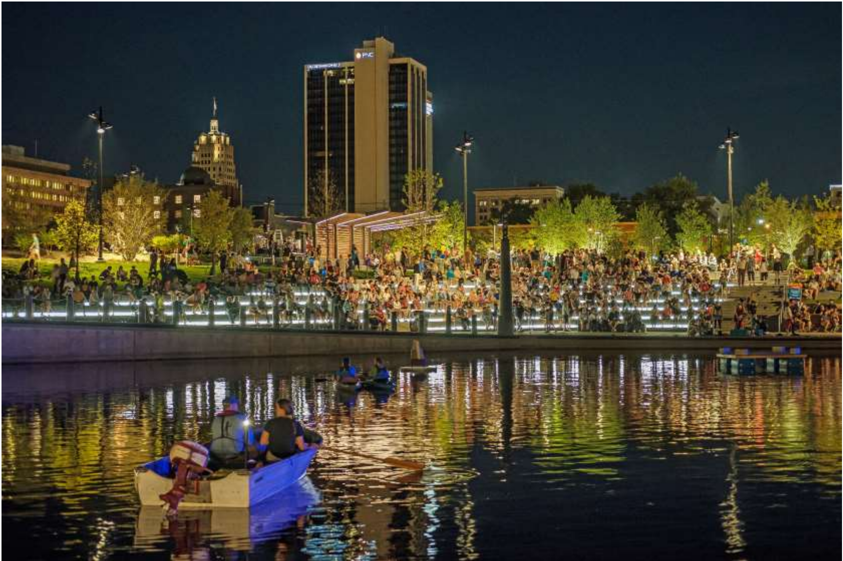
Promenade Park Grand Opening