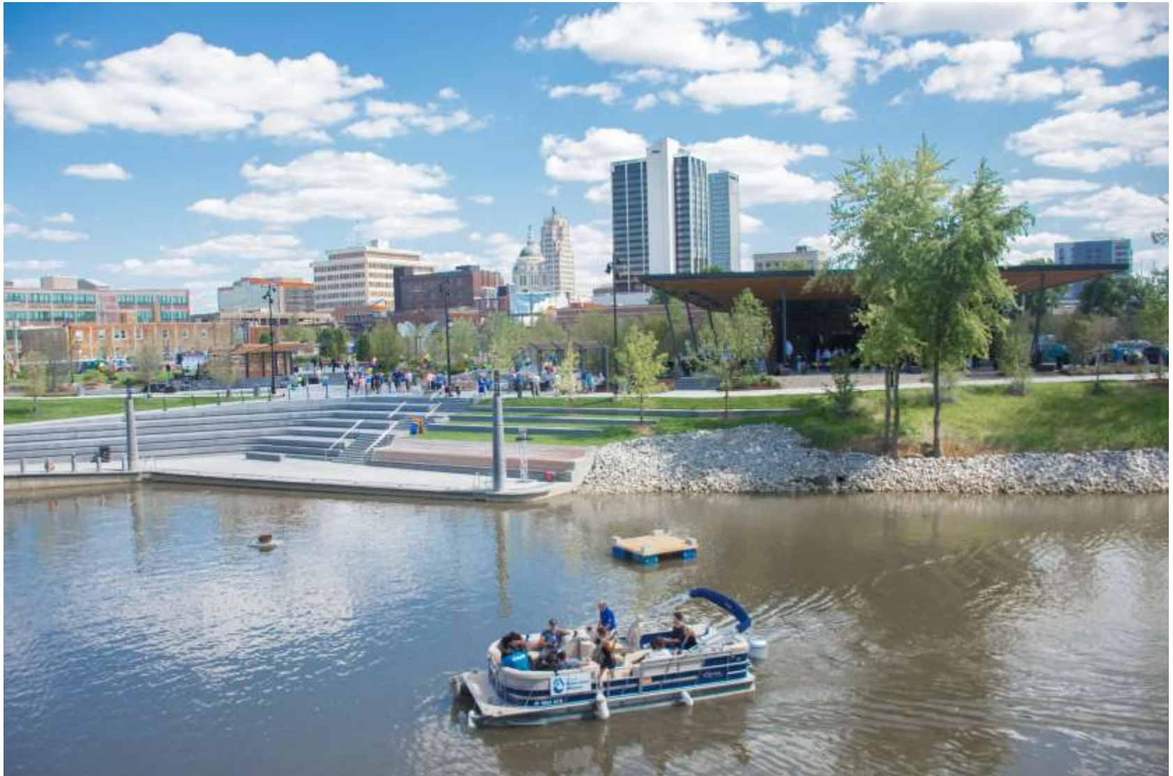
Promenade Park Grand Opening