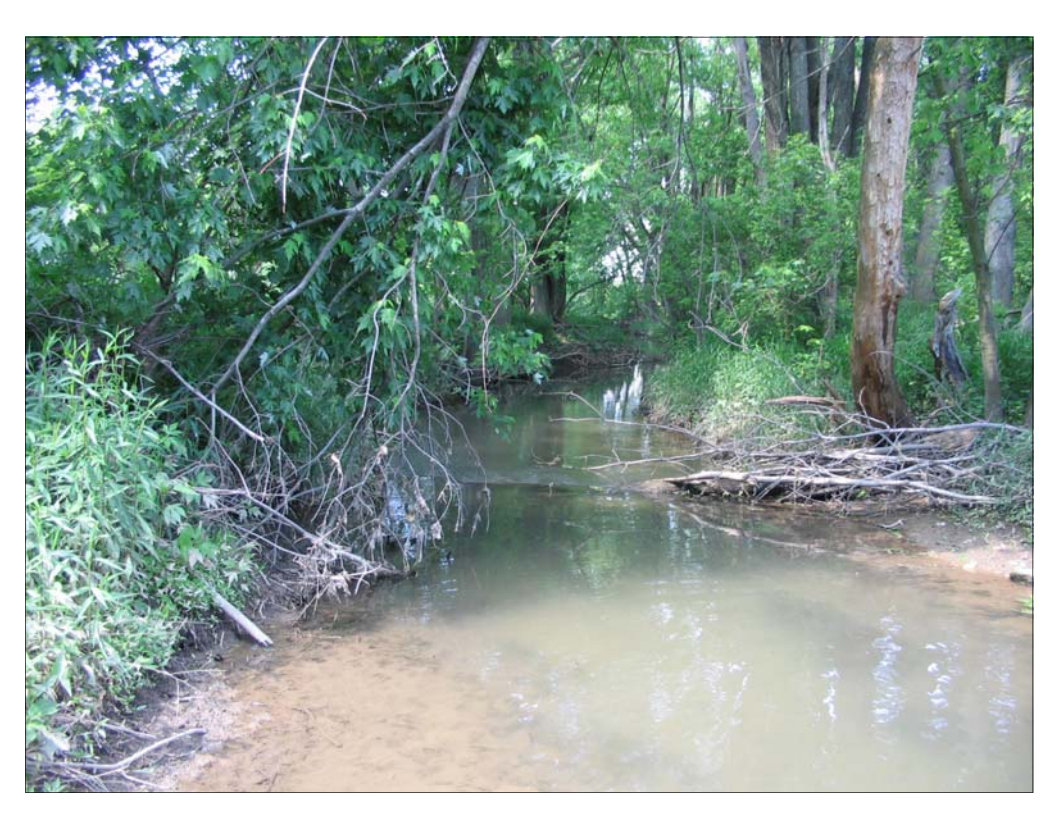
S7-Taylor Creek looking upstream.