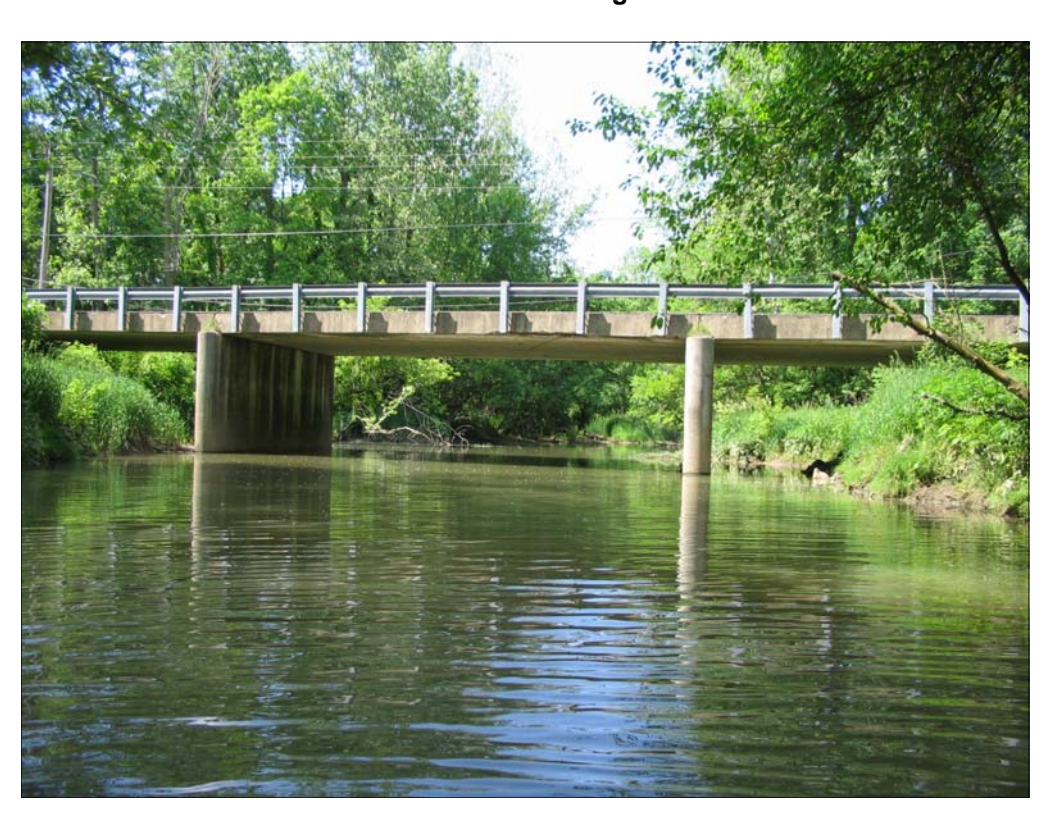
S8-Little Cicero Creek looking upstream.