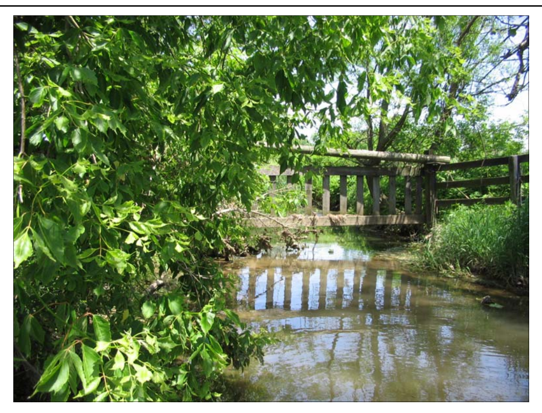
S2-Jay Ditch looking downstream.