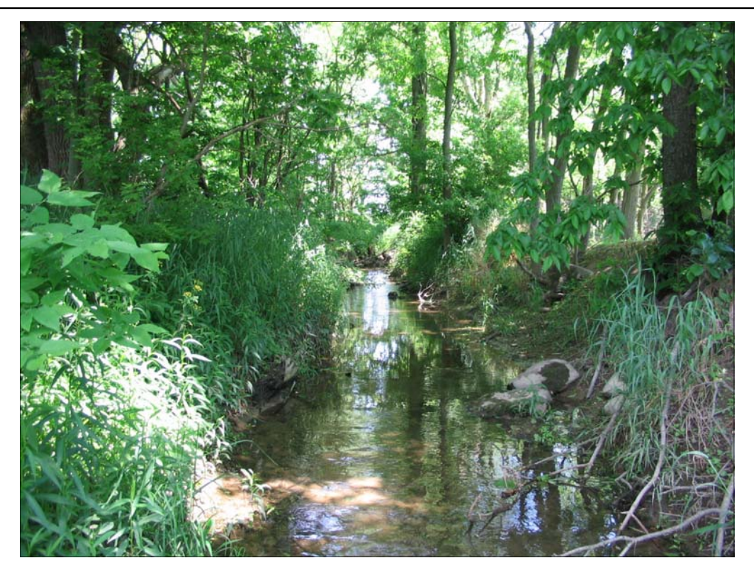
S5-Bennet Ditch looking downstream.