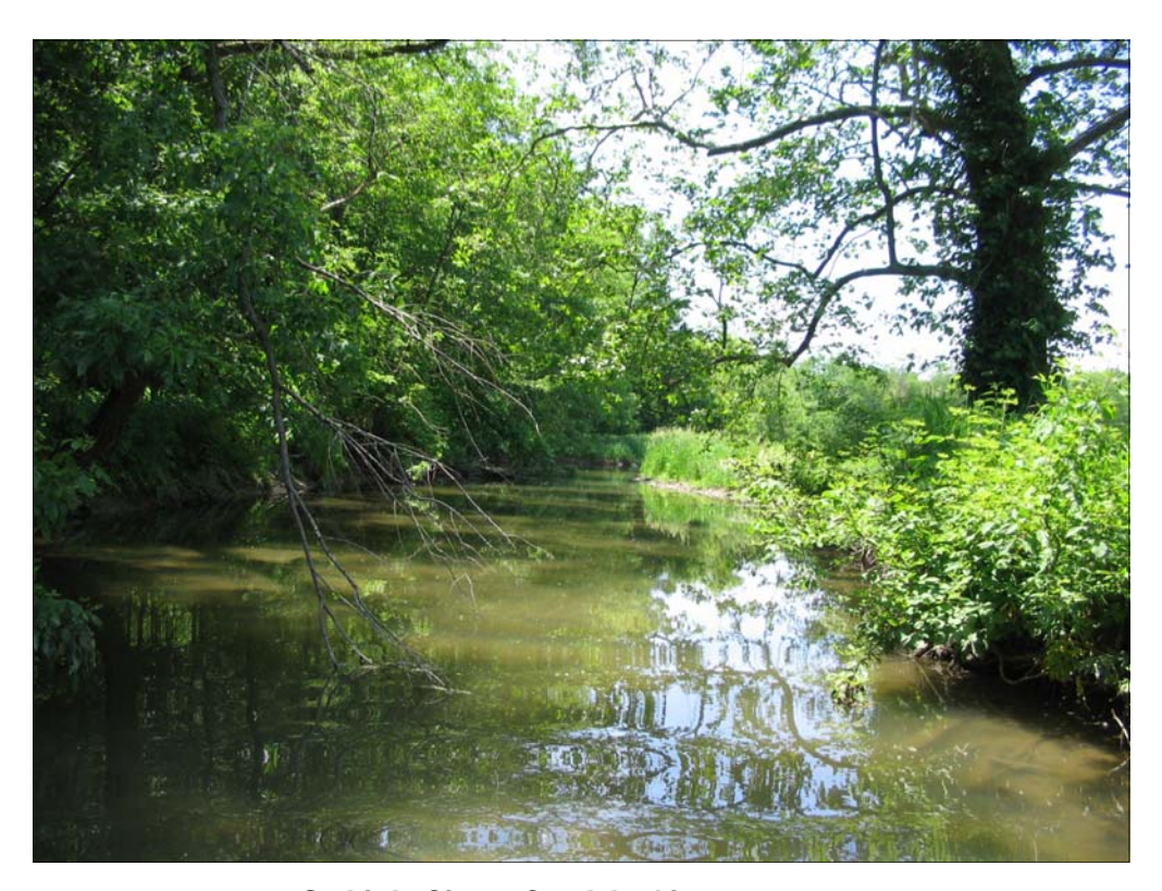
S4-Little Cicero Creek looking upstream.