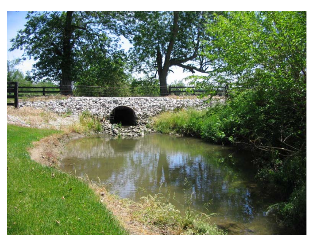
S3-Ross Ditch looking upstream.