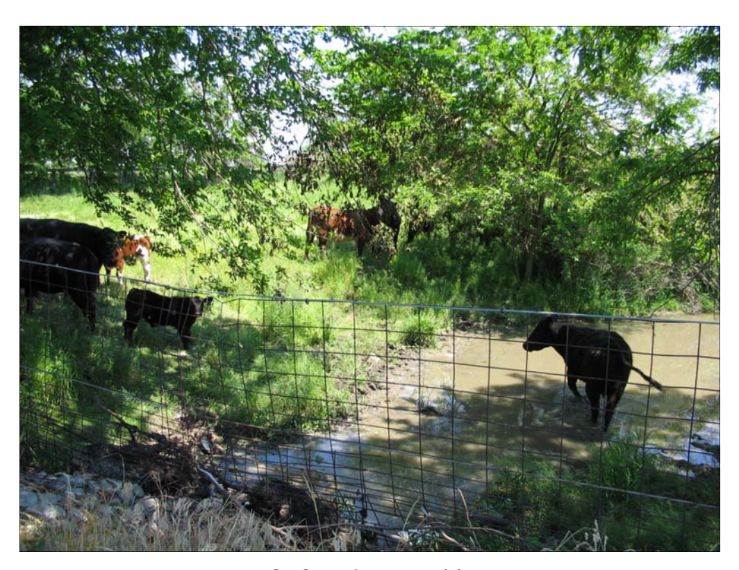
S3-Cows in stream (2).

708 Roosevelt Road, Walkerton, IN 46574 Phone 574-586-3400 / Fax 574-586-3446 www.jfnew.com