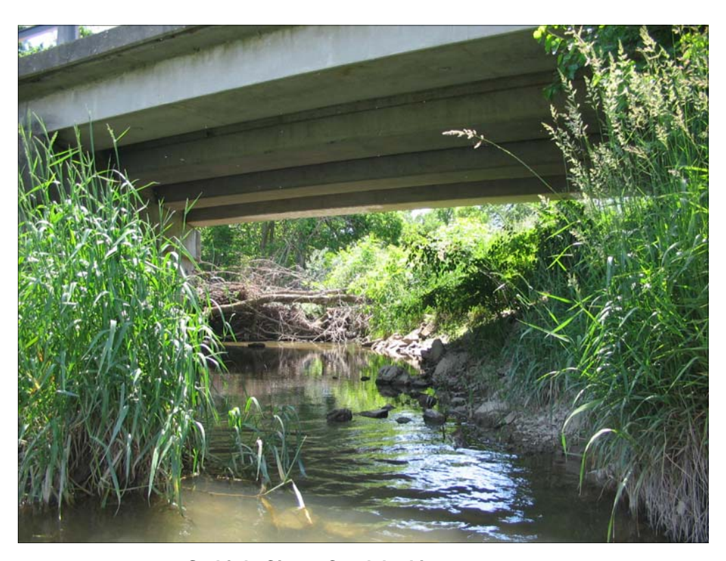
S6-Little Cicero Creek looking upstream.