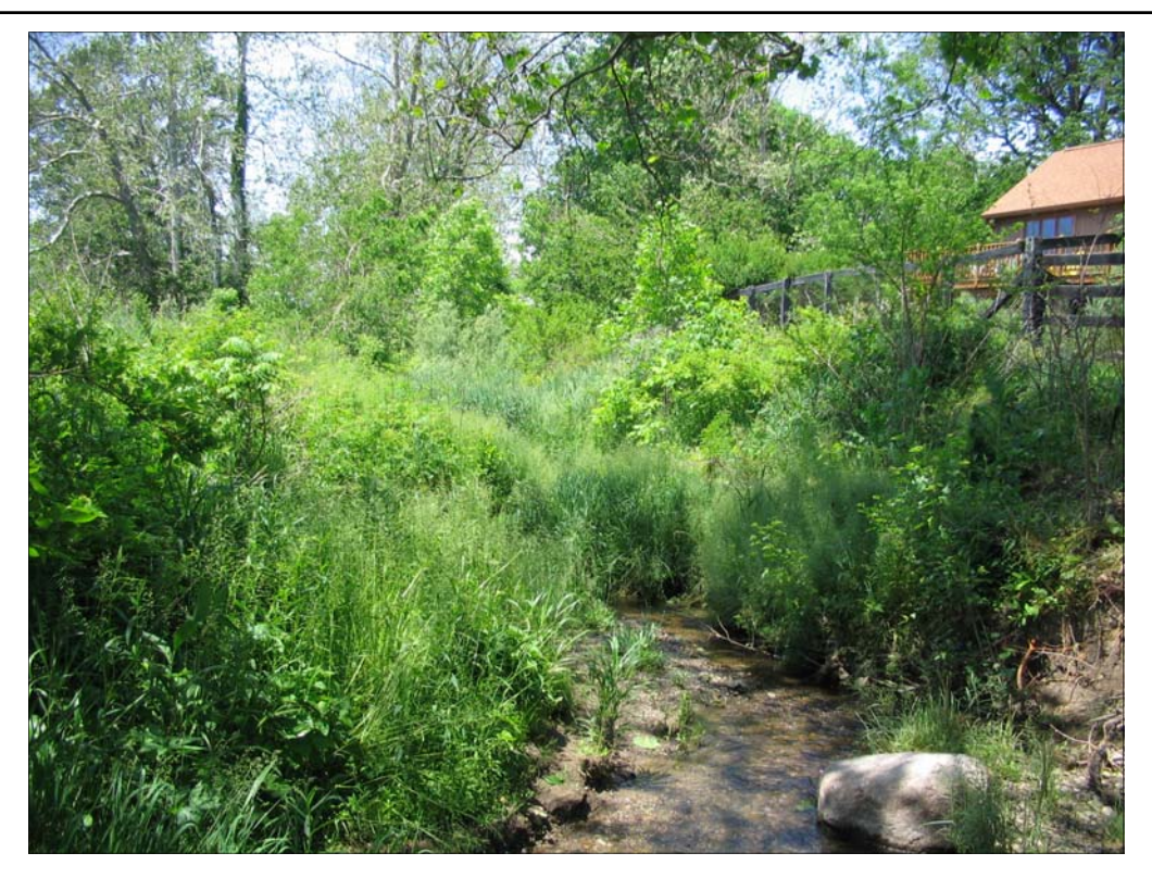
S3-Ross Ditch looking downstream.