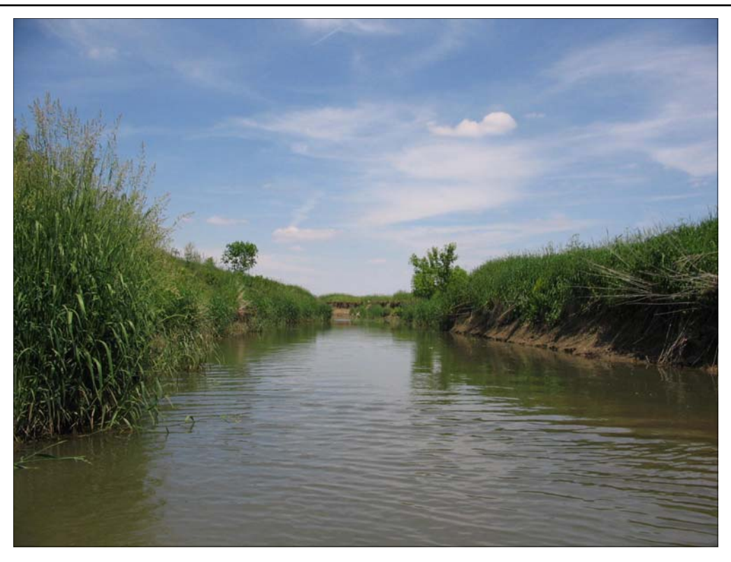
S6-Little Cicero Creek looking downstream.