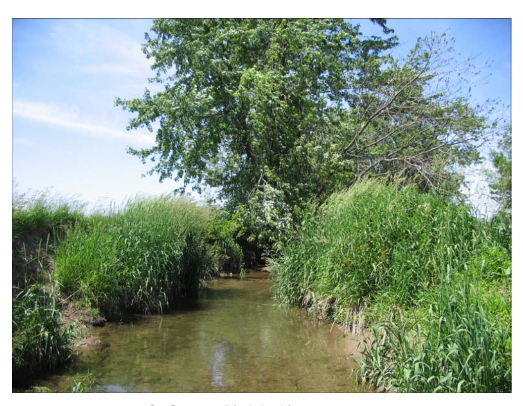
S1-Symons Ditch looking upstream.