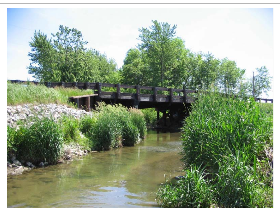
S1-Symons Ditch looking downstream.