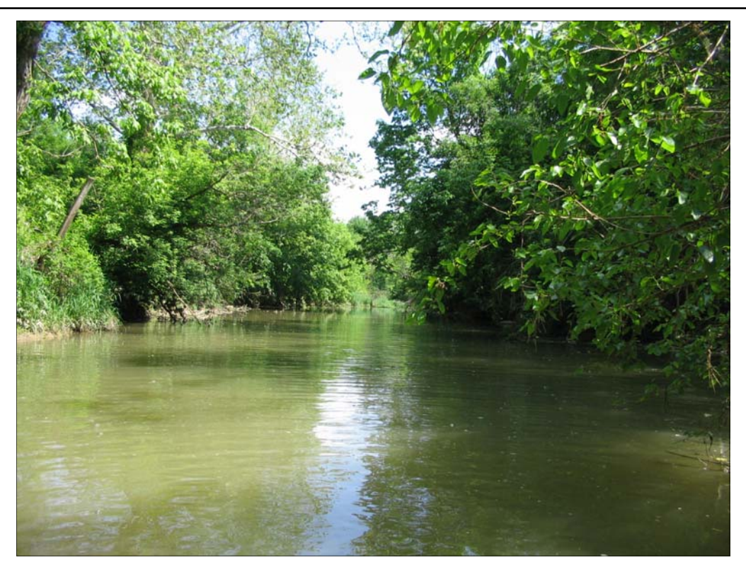
S8-Little Cicero Creek looking downstream.