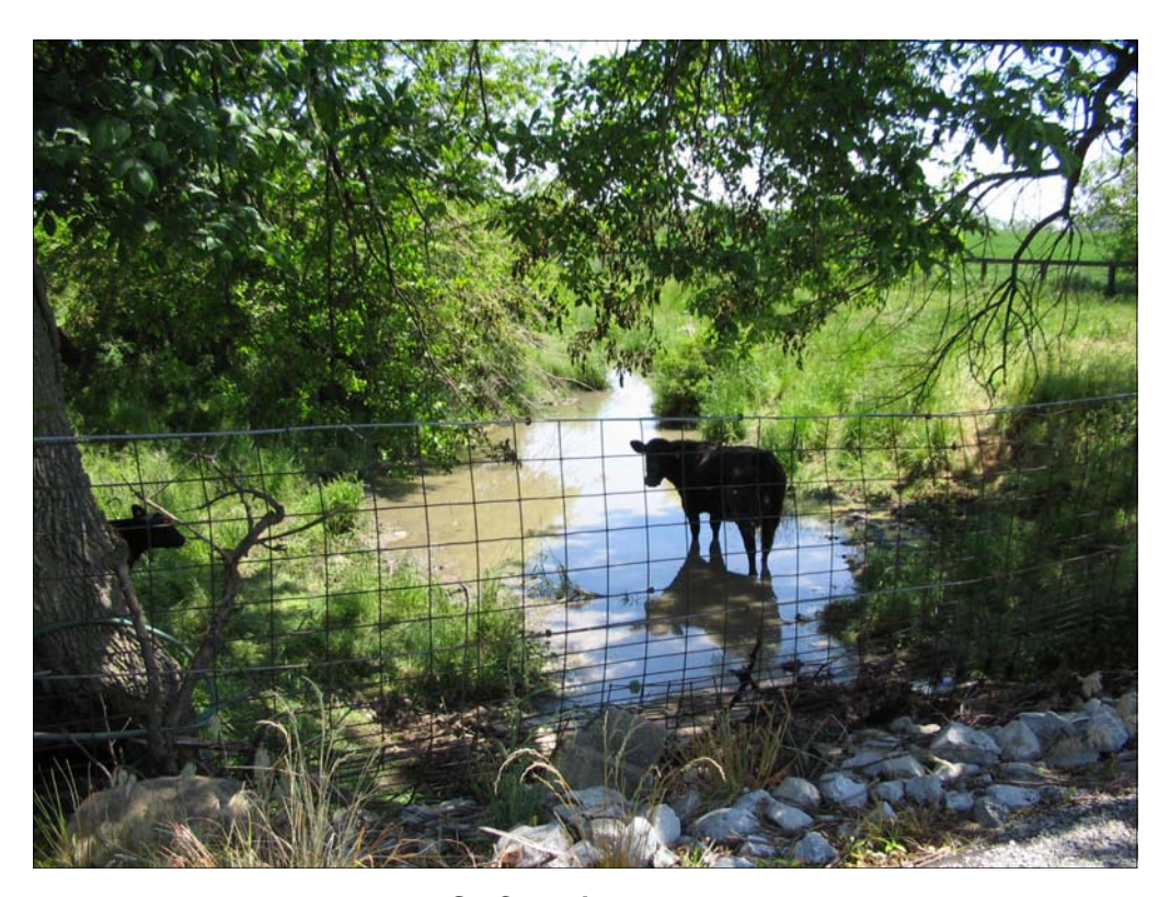
S3-Cows in stream.