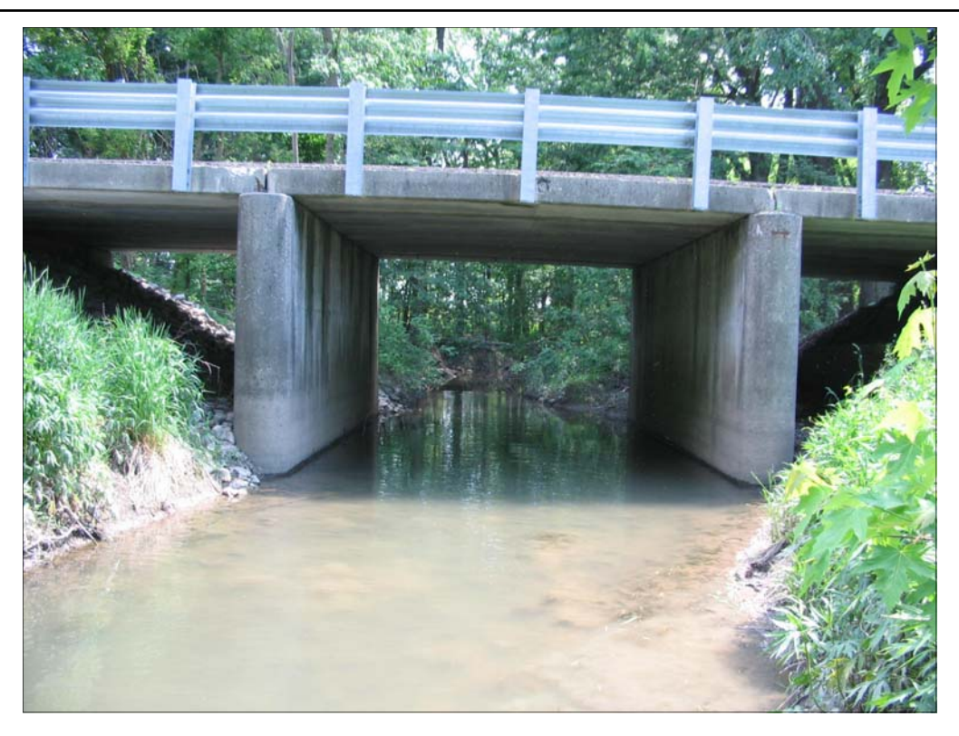
S7-Taylor Creek looking downstream.