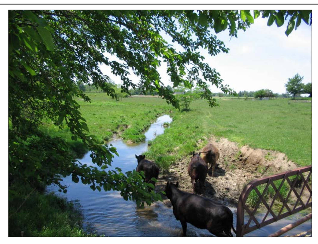
S2-Cows in stream.