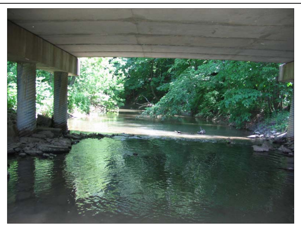
S4-Little Cicero Creek looking downstream.