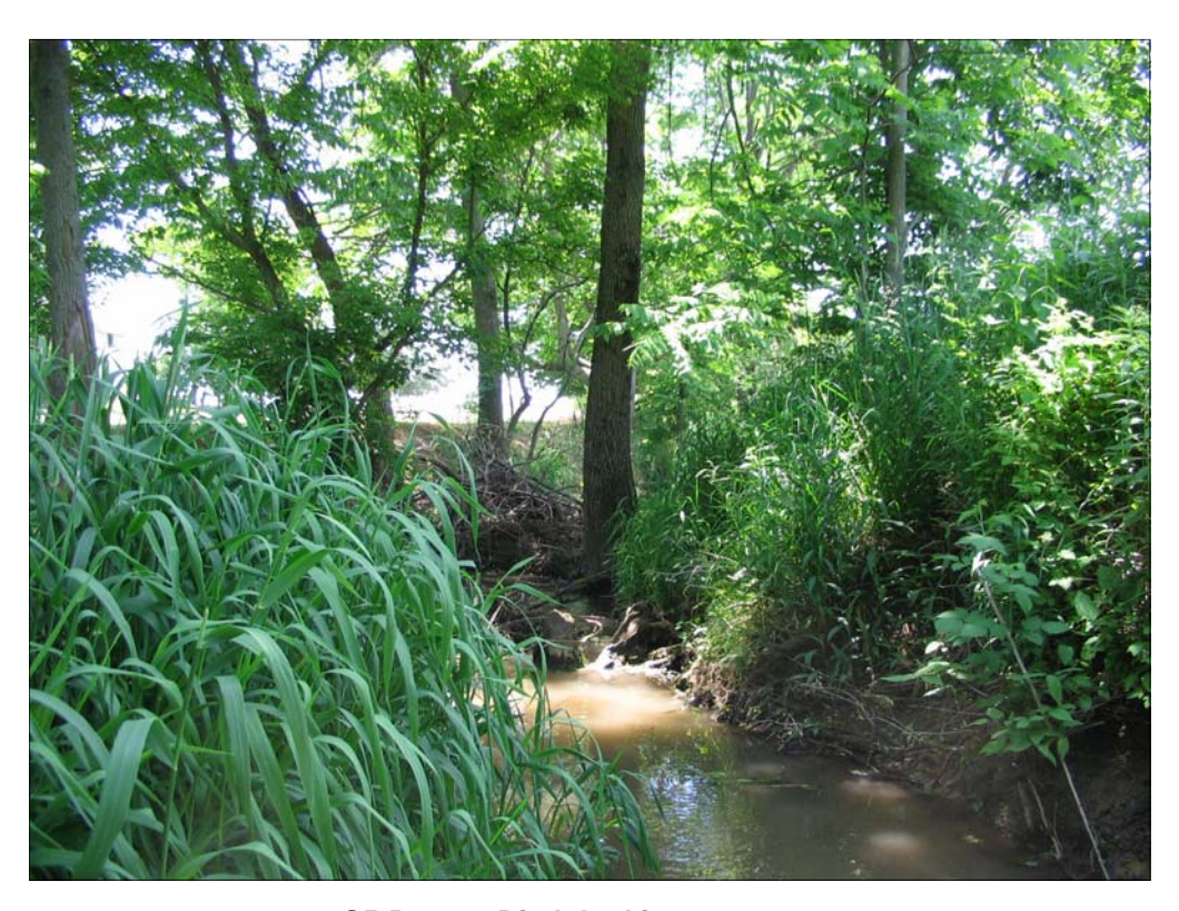
S5-Bennet Ditch looking upstream.