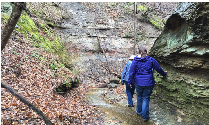
August 2018 addition to Mossy Point Nature Preserve